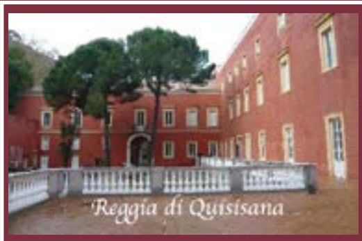
Reggia di Quisisana